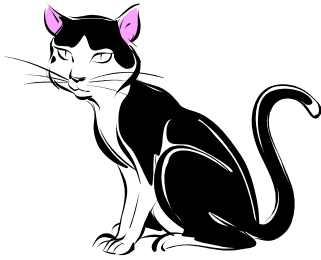
Jimmy the Cat

Here is a graph showing Jimmy's age in months vs. his weight in pounds. I've drawn a line that seems to fit the data points. Your first task is to determine the equation of the line which models Jimmy's growth.